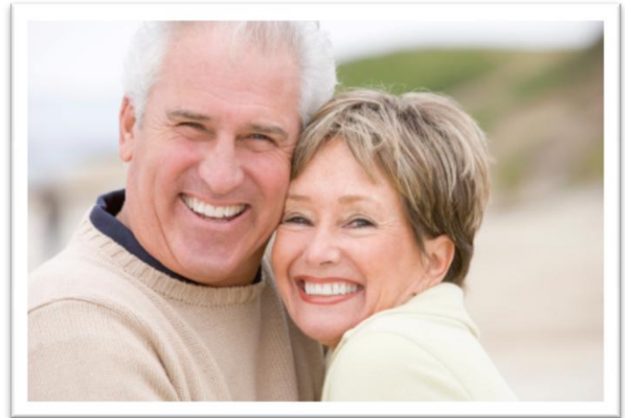
There are many factors that determine whether a person is a good candidate for dental implants or not.

While the final answer to this question is typically determined in a comprehensive examination of your teeth, gums and jawbone by your dentist, there are numerous other factors taken consideration, such as your overall health.