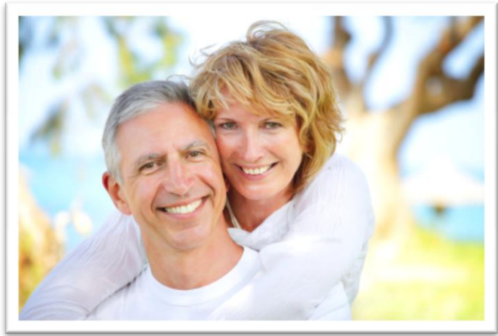
Dental Implants can create a beautiful smile for years to come!

There are differing opinions as to how long the healing time should be before the crown is placed. Impressions will be taken for a crown that will match your existing teeth.