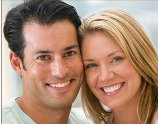
Most procedures can be done with minimal discomfort and interruption of your normal routine.

For some of the more invasive procedures including dental implants it could take several visits spaced out over several months to complete the procedure. Or, it could all happen within one visit!