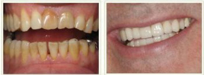
Veneers are a GREAT solution for an imperfect smile!