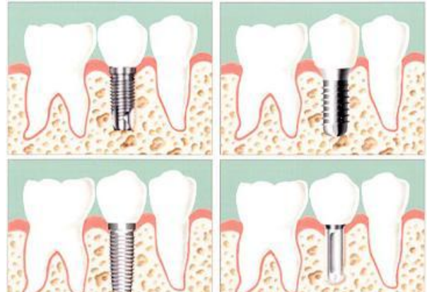
Dental implants provide a GREAT natural looking, permanent solution for people with missing teeth.

At my office, however, everything is performed in the same place by the same doctor. Because of my extended skills as both the surgeon and the cosmetic dentist, I am able to perform the entire procedure for you in my office, thus reducing the possibility of complications. This also helps you by speeding up the length of the entire process.