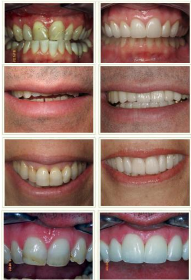
Does your doctor have lots of 'Before & After' photos?

If the dentist you're considering doesn't have any 'before and after' photos to show you, you may want to strongly re-consider your choice. Either they don't take enough pride in their work and don't want to show it off, or they're new to the game and simply don't have any results to show.